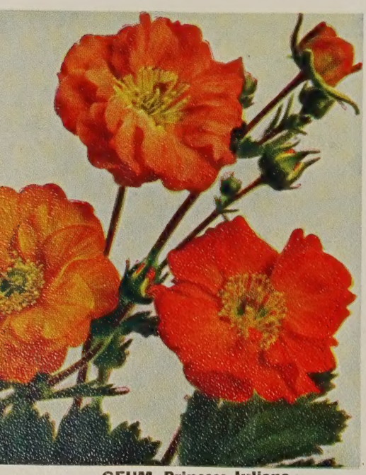
GEUM , Princess Juliana

Plenty of flowers for cutting all summer will be your reward when your perennial border is well established.